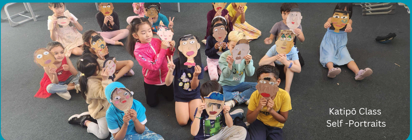
Katipō Class Self-Portraits

Pōwhiri first Monday at 9.30am CZ Athletics 28th Oct IZ Athletics 18th Nov Community Arts Festival 27th Nov Leavers' Dinner 4th Dec Fun Day 9th Dec Reports home 12th Dec Last Day 16th Dec